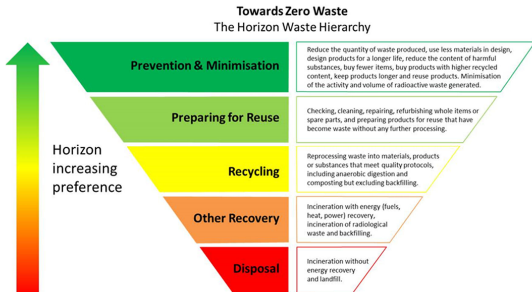
Figure 15-1 The Horizon Waste Hierarchy

15.3.1 The basis of the approach to waste management across the Wylfa Newydd DCO Project is Horizon's Waste Hierarchy ( Figure 15-1 figure 15-1 ). It aims to encourage the management of waste proactively in order to minimise the amount that is discarded and to recover the maximum value from the wastes that are produced, with disposal as a final option.